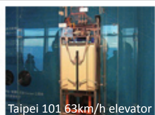
Taipei 101 63km/h elevator