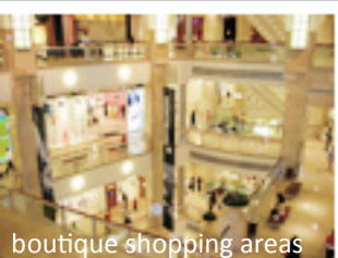
boutique shopping areas

Icons of its past include the Boa-an Temple – a masterpiece of ancient Chinese artwork– and the National Palace Museum – holding the world's largest collection of over 700,000 pieces of Chinese antiquity.