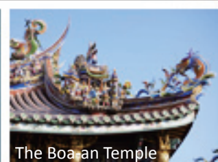
The Boa-an Temple